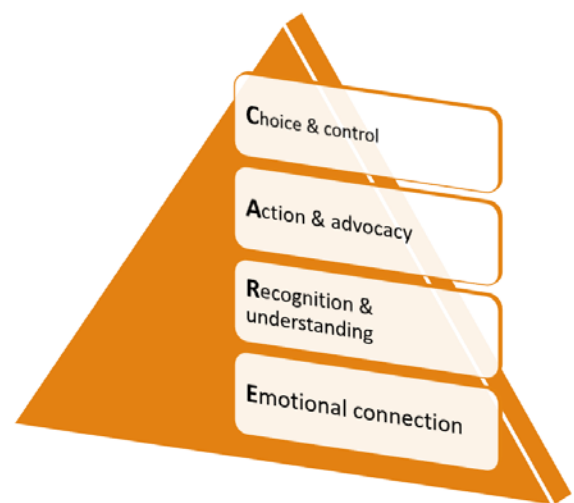
CARE Model for first line response

In addition to LIVES, which addresses 'what' practitioners should do, a systematic review of 31 interview and focus group studies globally with women survivors suggests 'how' practitioners should approach women (see CARE model). 48